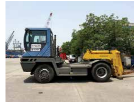
Tug Master (for pulling/pushing the roll trailer)