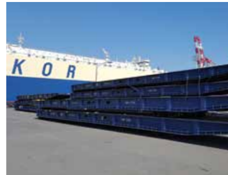
Roll Trailer (for various cargo types)