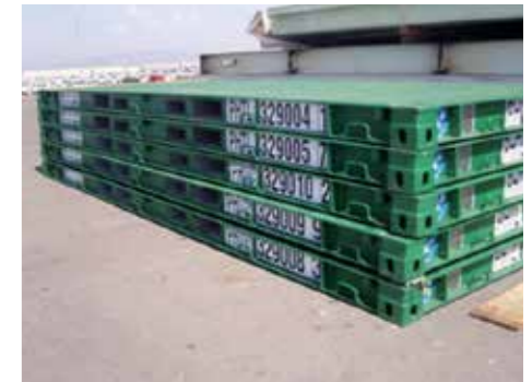
Bolsters (for large quantities of small cargo e.g. paper or steel reels)